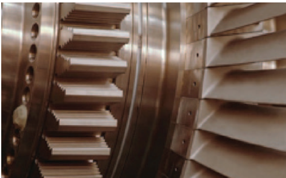
Caption here.