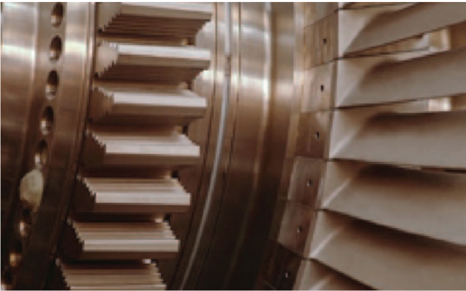
Caption here.