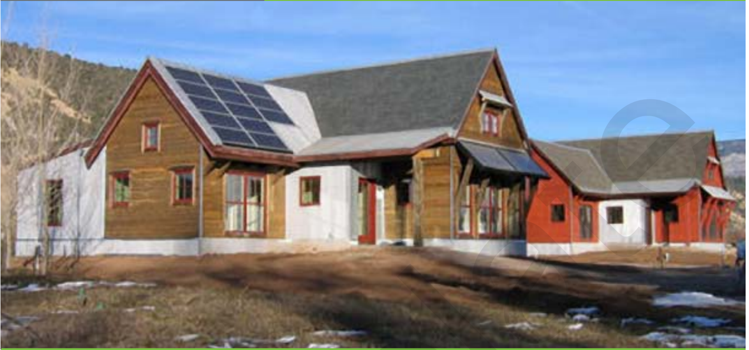
Caption. Photo credit